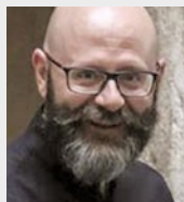
Girls Choir Luigi Leo (Italy)